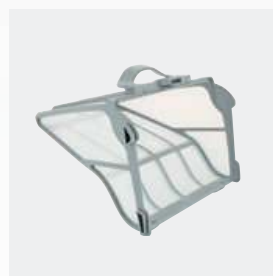
Filter canister Very thin, large-capacity rigid filter (5 litres)