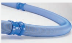
Set of 6 x 1m hoses Twist Lock