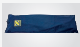
Winterizing bag for hoses