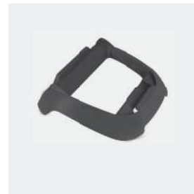
Base For control unit