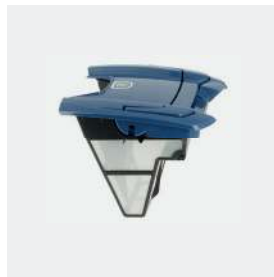
Filter canister Debris up to 100μ